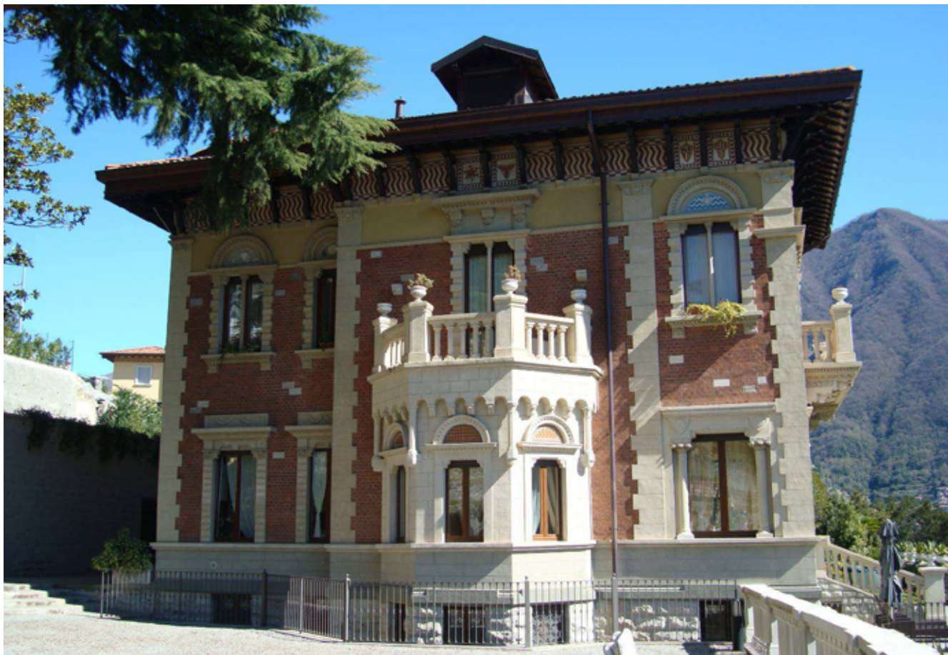
Sopra: vista villa dal lato giardino – Sotto: progetto della piscina nel giardino privato Above: villa view from the garden – Below: project of swimmingpool in the private garden