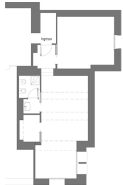
Piano seminterrato ca 70 mq Basement approx. 70 sqm