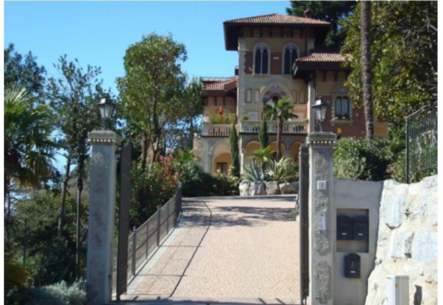
The entrance to the villa and details of the interior rooms apartment on the top floor